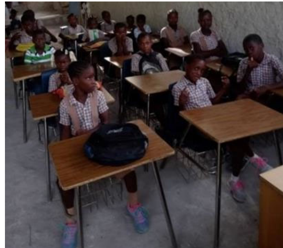
Some of more than 1,000 desks from Fresno that were distributed to schools in Haiti.