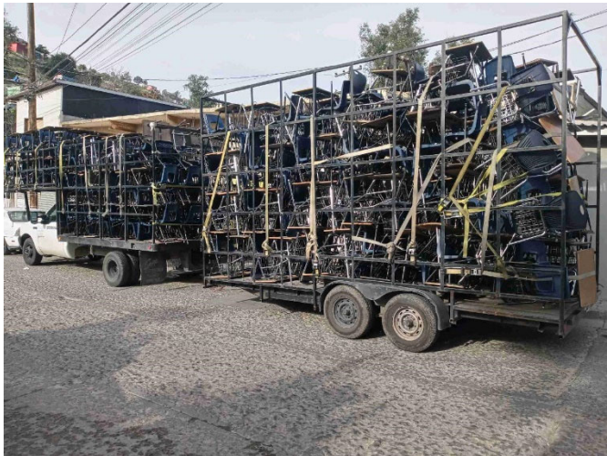
Fresno desks headed for schools in central Mexico. The desks have been re-packed onto open trailers to simplify inspection and clearance at Customs.

In the end, through Fresno USD’s partnership with MeTEOR and The Reuse Network, tens of thousands of kids will reap the benefit of Fresno’s commitment to reuse. At the same time, the District has kept nearly 100 tons of what is definitely not “waste” out of the landfill. Those are the results that really count.