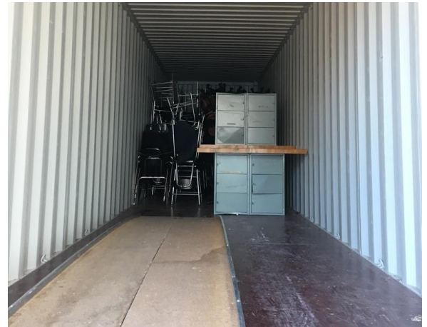
A few of more than 11,000 items from Las Cruces and Santa Fe, NM, provided to students across the U.S. and around the world.

Worth it? Heck, yes. Nearly 2,000 desks, over 1,000 classroom tables, nearly 1,300 bookshelves and storage cabinets, nearly 5,300 student chairs, and some 2,000 other items including teachers desks, lounge and reception area furniture, music stands, cafeteria tables and chairs, and much more. All taken away from American landfills, all now being put to use, helping kids and communities where buying new school furniture isn't an option.